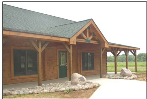
The two prominent rocks on either side of the walkway have attached plaques commemorating the achievement of both the city and the O'Fallon Rotary Clubs cooperative venture.

“Moreover it displays the commitment of the Rotary Clubs of O'Fallon to their community and their desire to do good works locally through their consistent service.”