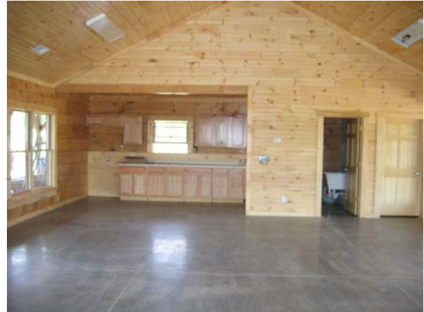
The openness of the interior makes the Nature Center ideal for multiple functions.

The Rotary Nature Center is a log cabin type structure of approximately 1,300-square feet and is designed to fit into the natural environment of the Park. The building has a wide porch on all sides for use as outdoor classroom and viewing areas with tables and benches. The interior will be an open room that can be configurable for any number of uses. The building is located in a 100- acre park containing a surprising diversity of natural habitats, including several different forested areas, a newly established tall grass native prairie, meadows, woodland-meadow interface zones, an intermittently flowing creek, and an amphibian pond. The Rotary Nature Center will support natural sciences, ecology and environmental