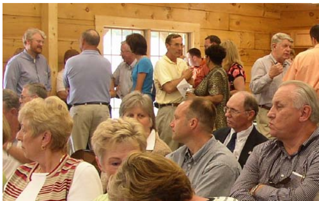
Rotarians, families and guests enjoying the spacious log cabin decorate, ideally suited for the park preserve.

sciences and outdoor education opportunities for city school students, as well as providing a venue for a wide array of gardening, nature study, nature crafts, bird watching and other related year-round activities and programs for children and adults of all ages. This city-operated facility will be available to the citizens of O'Fallon as an ideal "urban nature center" and will serve as a nature focal point for the entire community.