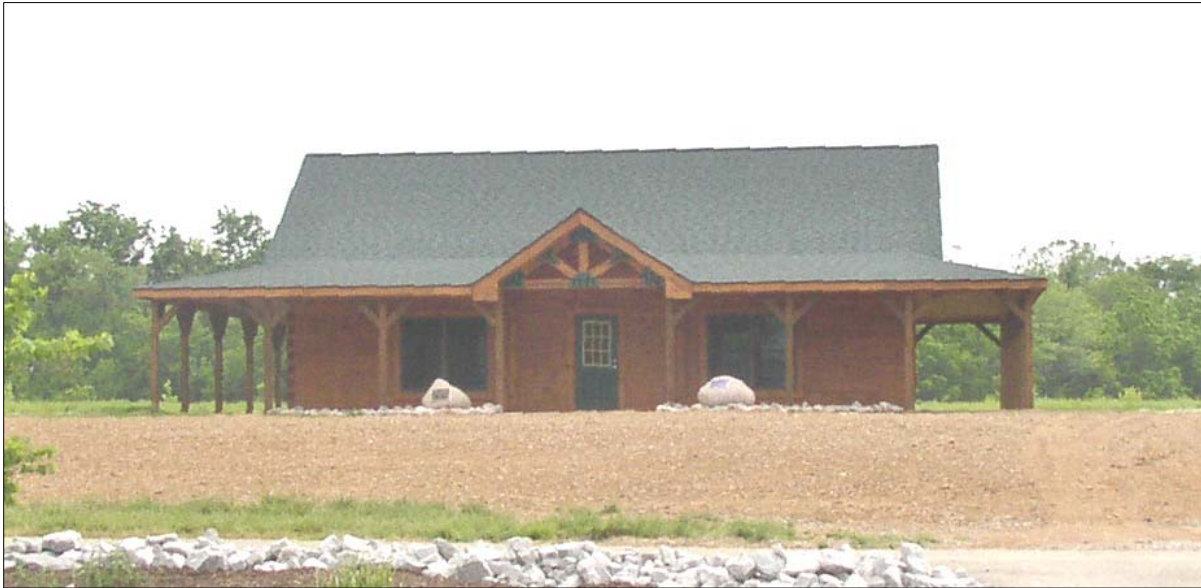
Rock Springs Park Nature Center